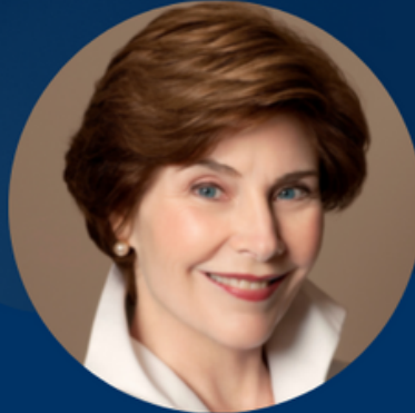
LAURA BUSH First Lady of the United States (2001-09)