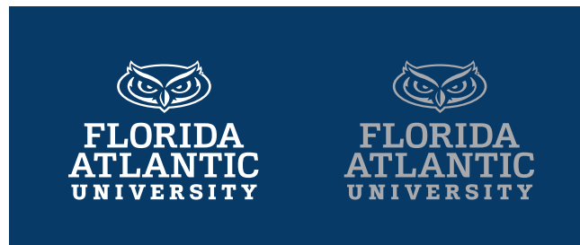
WHITE, GRAY/SILVER for dark backgrounds