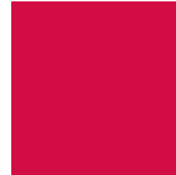
FAU RED PANTONE 200 CMYK: 20C - 100M - 81Y - 10K WEB SAFE/RGB: CC0000