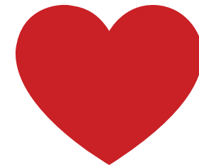
EXAMPLE: The red heart for the Florida Atlantic Giving Day initiative