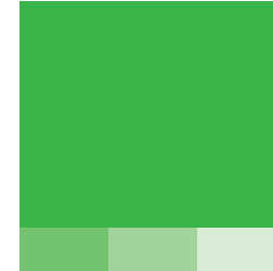
BRIGHT GREEN PANTONE 361 CMYK: 75C - 0M - 100Y - 0K WEB SAFE/RGB: 39B54A