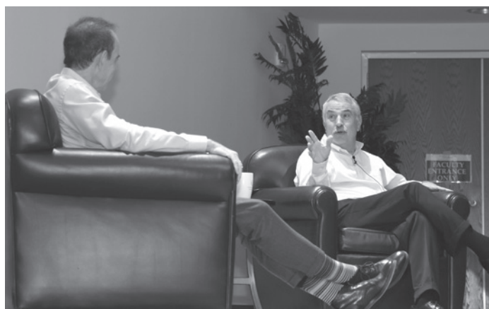
From Left to Right: Tim Naftali, Ph.D., special speaker; and Tom Friedman, special speaker. Picture taken during the 2022 Winter semester.

REGISTER EARLY! There is a $5 charge for registering on the day of a one-time lecture or event.